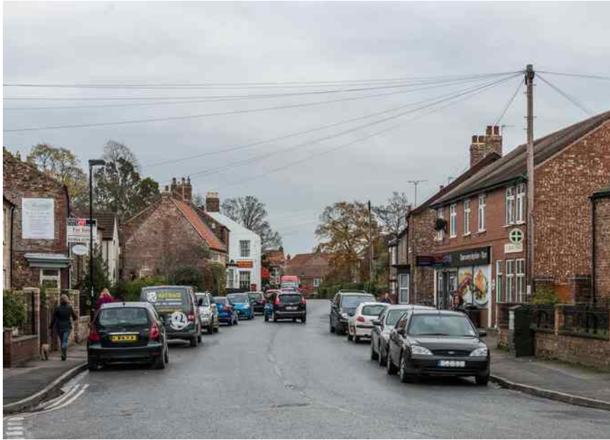
Shopping Traffic on The Village