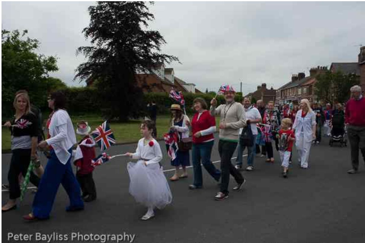
The start of the Diamond Jubilee Parade, West End, Strensall

The 6,500 people of the Village are characterised both by those whose families have been here for generations and the many who have moved here within the last thirty years.