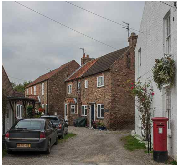
An old driveway in the centre of the Village

Strensall began with a typical medieval pattern of properties, with narrow-fronted plots of land that extend back on either side of a single West-East Street (the present Church Lane and The Village). The plots on the north side were bounded by the River Foss and those on the south side stretched to Back Lane (now Southfields Road).