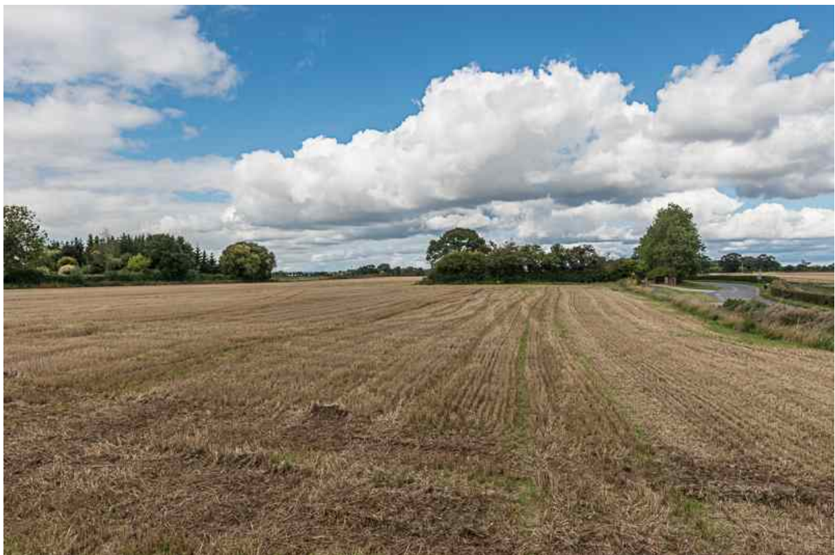
Looking towards Sheriff Hutton and Strensall Cemetery from New Lane.