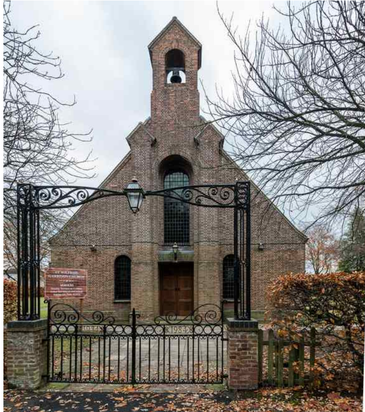
St Wilfrid's Garrison Church