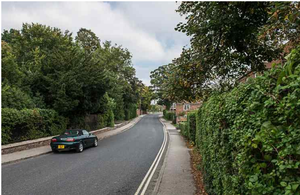
The Village, Strensall

Strensall with Towthorpe is a low crime area and is seen as a safe place to live. The range of shops and pubs is seen as a key part of Village life as is the regular bus service to York. The Churches play a large part in community life as does the Library, the Robert Wilkinson School and the Post Office, all of which are seen as essential amenities.