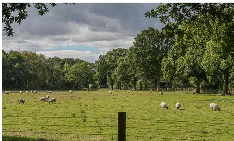
Oak Trees on Strensall Common

The majority of the TPOs cover oak trees. These trees must be safeguarded throughout their natural lifespan. Full details of the TPOs can be found on the City of York Council website.