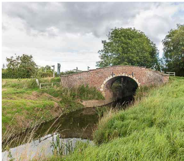
Strensall New Bridge - "Old Humpy"

During its working life, the canal carried important cargo of coal, lime, farm produce and building materials. In 1845 the York to Scarborough railway opened, taking most of the cargo and revenue from the canal and causing its closure. In a short walk along the River Foss you can still see the industrial archaeology left over from the canal, including lock walls, sluice gates, winding gear, and the historic Strensall New Bridge.