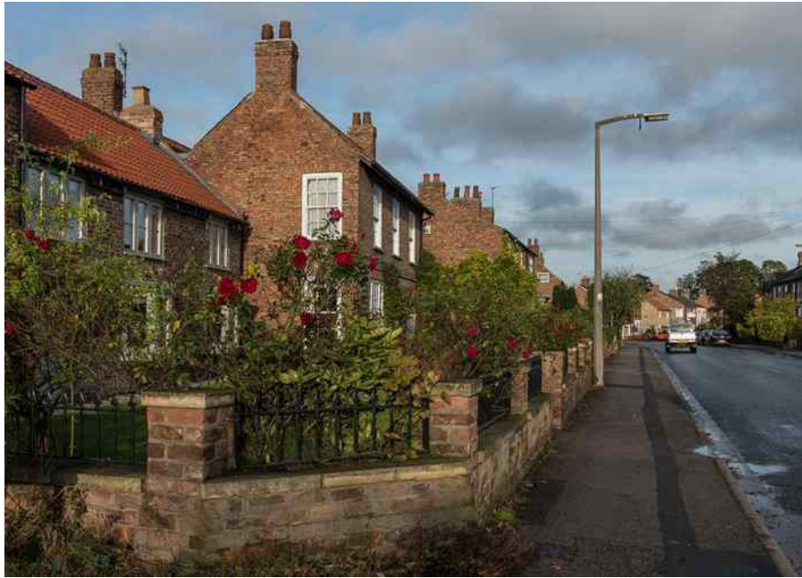
The Village, Strensall