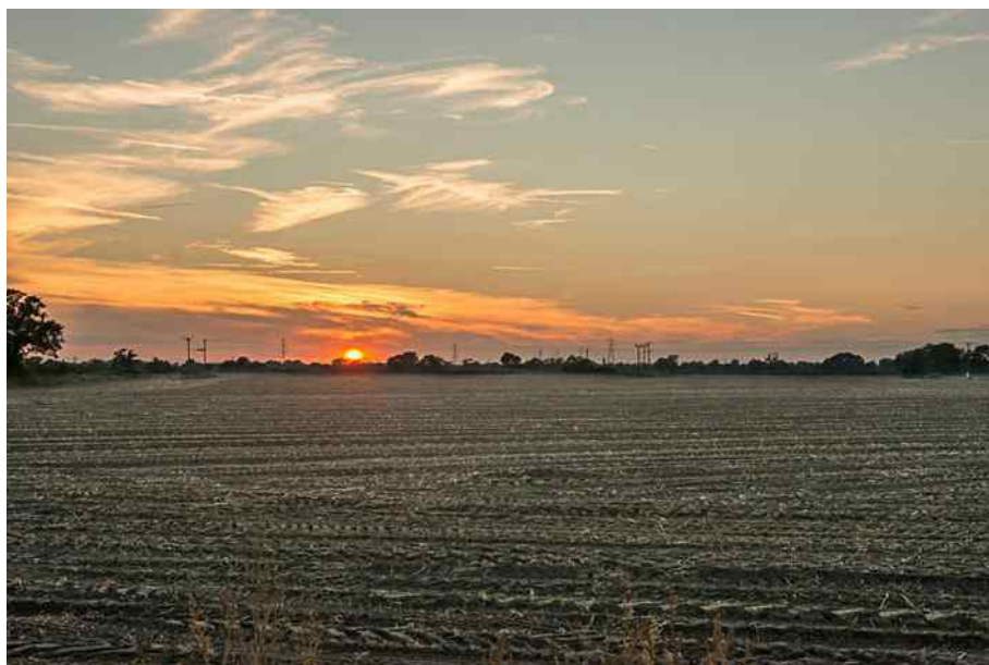
Looking West from York Road - Winter fields at Sunset.

The natural bottleneck within the Village is its centre, based around the junction with the Sheriff Hutton road. Traffic often grinds to a halt as through traffic competes with the bus service and shoppers' parking. In addition, the three level crossings and the roundabout at the junction of Ox Carr Lane and the York Road cause periodic delays on most days.