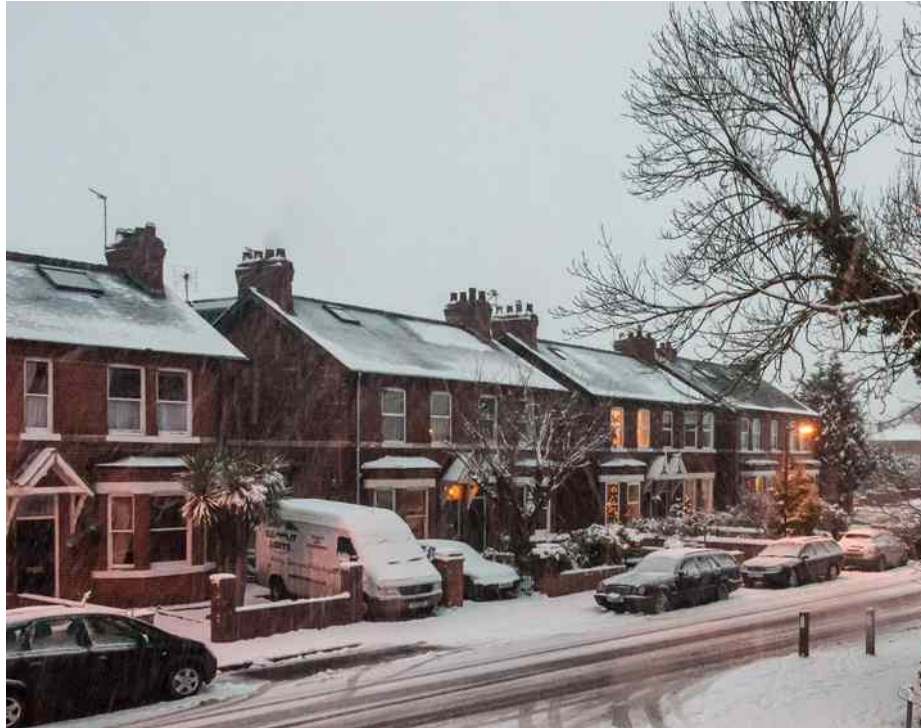
Former Railway Housing