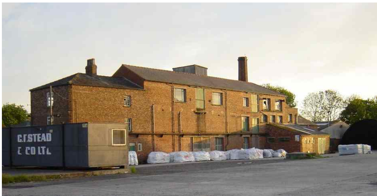
The Tannery, Strensall now demolished