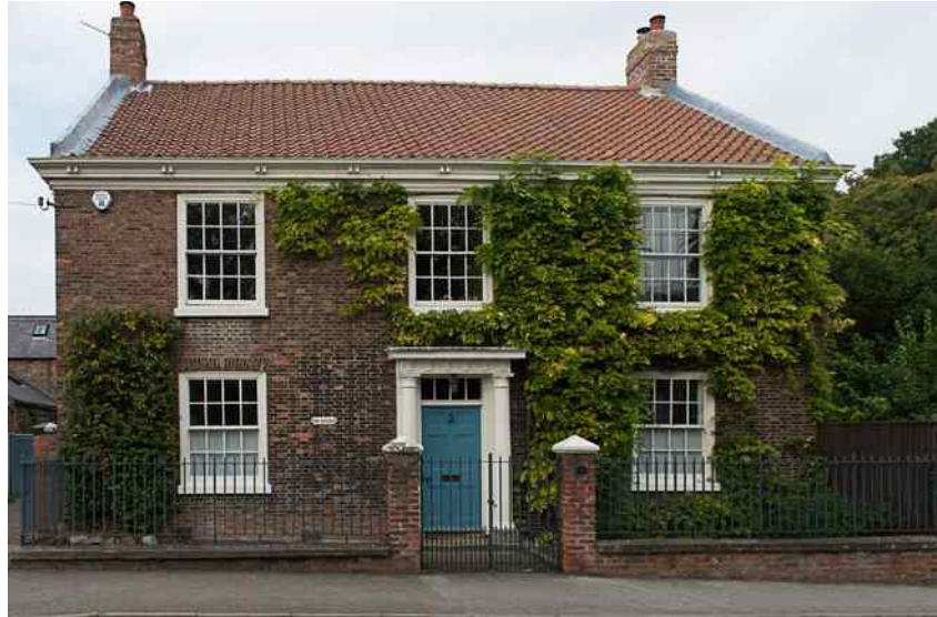
The Grange, Strensall

The eastern section of The Village appears quite intimate as the street curves and undulates gently, with subtle variations in carriageway width and some buildings huddling closer to the street frontage. Trees and hedges add to the feeling of enclosure and ‘protection’. The more traditional areas of the village demonstrate a sense of continuity of character.