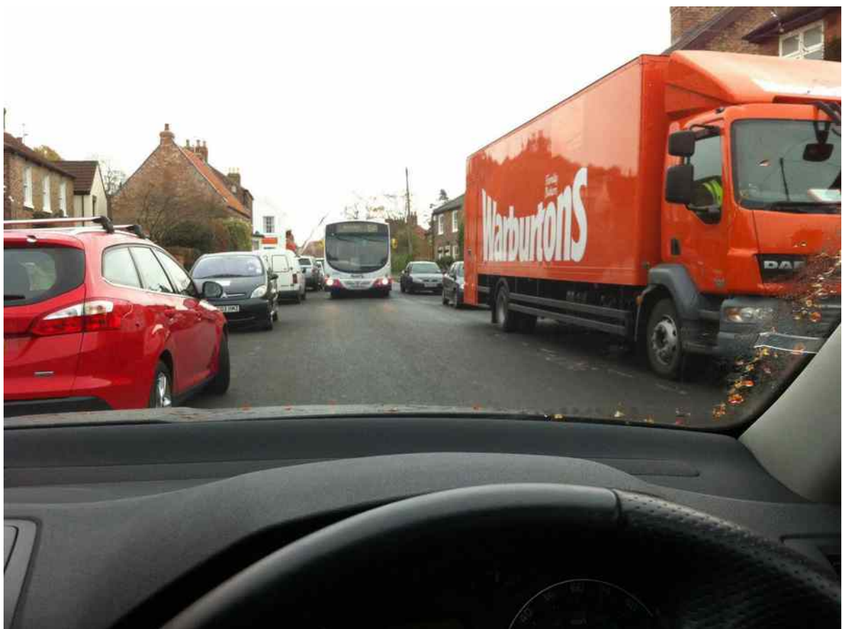
The First Bus Service in the Village centre during shopping time

The First Bus service is valued and much used within the Village. It is, however, not easily accessible from many parts of the Village. In addition, it contributes and is subject to the traffic congestion in the centre of the Village.