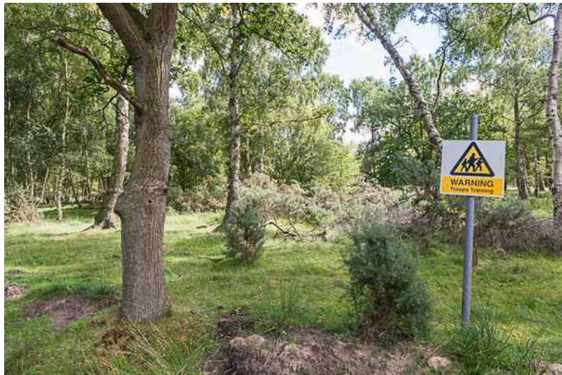
Strensall Military Training Area

The War Department purchased Strensall and Towthorpe Common in 1884. The lawful use of the Common is governed by three legal publications, Strensall Common Act 1884; Strensall Common Regulations and Strensall Common Bylaws, approved by Act of Parliament.