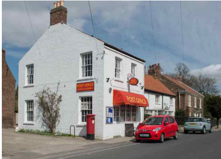
Strensall Post Office at the heart of the Village

generally felt that they provide good amenities for the size of the Village. The Post Office and the Library are, in particular, held in high regard and viewed as essential assets. However, the absence of a bank is viewed as a particular disadvantage, although the availability of Cash Machines at Cost Cutter and Londis is greatly appreciated.