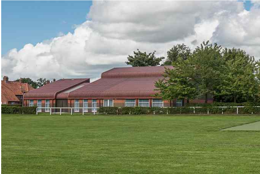
The Village Hall

With the roof leaking and the maintenance of the old building becoming more and more difficult, serious fund raising and grant hunting started in the Village and a new hall was built at Northfields at a cost of £279,000 in 1989. It included a badminton hall, meeting room, kitchen and other facilities and in 1990 won an award as the Ryedale Village Hall of the Year. Looking to the future, the hall was designed so it could be extended and the need for this soon arose. A new function room costing £60,000 was added and officially opened by the Lord Mayor of York in 1998.