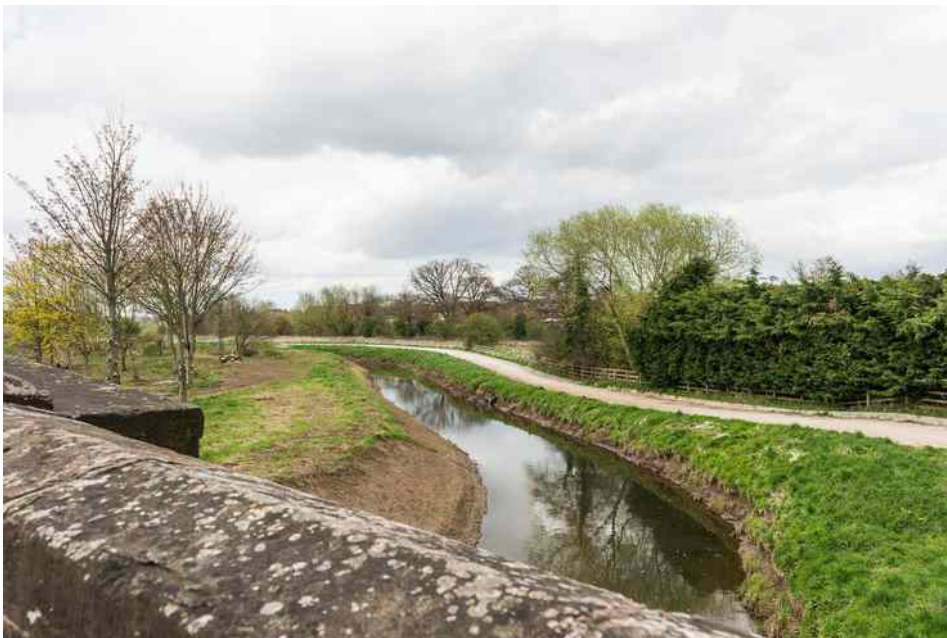
Footpath running North East along the River Foss from Strensall Bridge

All these paths combine to provide a good, free to use, recreational facility. This benefits the overall health and well being of Villagers and provides an opportunity to see the varied wildlife within the Parish.