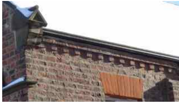
Decorative Banding and Brick Cambered Lintel

Most retain their original features, such as sash windows and cast iron downpipes. Also, within this character area are a number of larger or more prominent detached properties which reflect the expansion of the Village during the late nineteenth and early twentieth centuries.