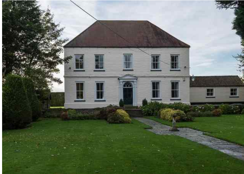
Manor House Farmhouse, Strensall