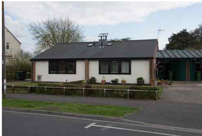
Sheltered Housing on Southfields Road

Most housing within Strensall with Towthorpe was built in the last quarter of the 20 th Century and there are now some 2400 dwellings in the Village with a resident population of about 6500 people. Most of the modern developments were built in varying styles and types with relatively short roadways, often small cul-de-sacs. The properties vary in size from two bedroom semi-detached houses to large detached houses.