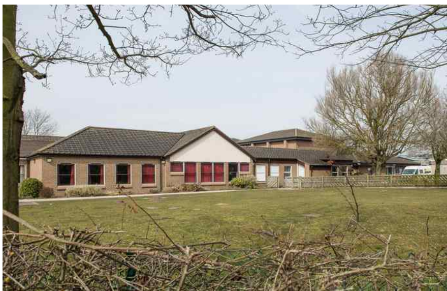
Robert Wilkinson Primary Academy