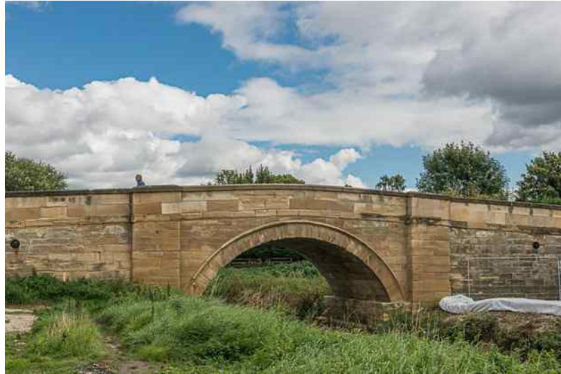
Strensall Bridge - John Carr's Bridge

The River Foss was canalised and a new canal was dug north from Strensall to Sheriff Hutton Bridge. Due to financial limitations, the work stopped in 1805 half a mile west of Sheriff Hutton Bridge.