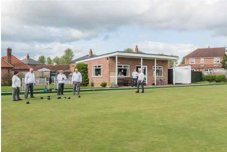
Strensall Bowling Club

Strensall Bowling Club is a thriving organisation founded in 1934. The Club is a self-supporting members' club which encourages membership across the ages from within the community. Its Bowling Green is one of the finest in North Yorkshire. It is the treasured result of dedication by members and advice from York Golf Club.