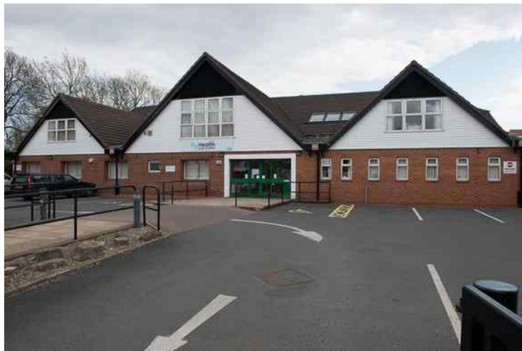
Strensall Health Care Centre

The My Health Health Care Group runs Strensall Health Care Centre and other centres in Stamford Bridge, Dunnington and Huntington. It serves 18000 patients across an area of 200 square miles to the north east of York. It has recently been granted approval to extend its boundary northwards into the Howardian Hills. It currently has 12 doctors who have specialised in General Practice and who provide complete National Health Service community services. The practice also employs 6 directly-employed nurses. Community nurses are attached to the practice and work from their base in Strensall Health Care Centre. A Minor Illness Clinic is held each weekday morning and afternoon at Strensall Health Care Centre.