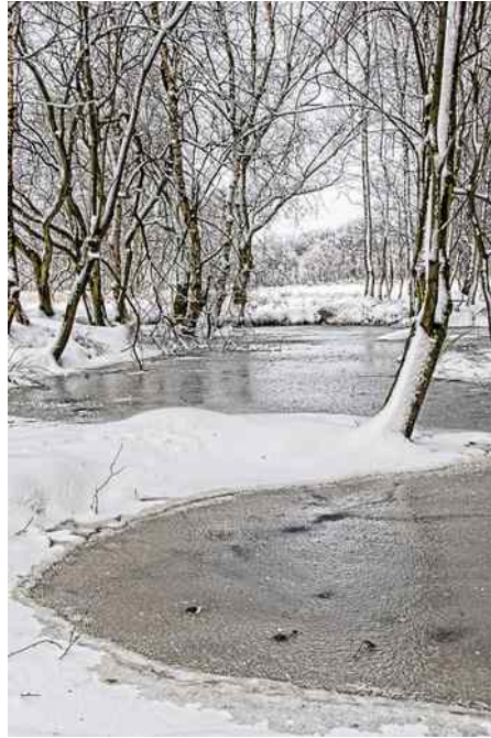
Winter ponds on Strensall Common