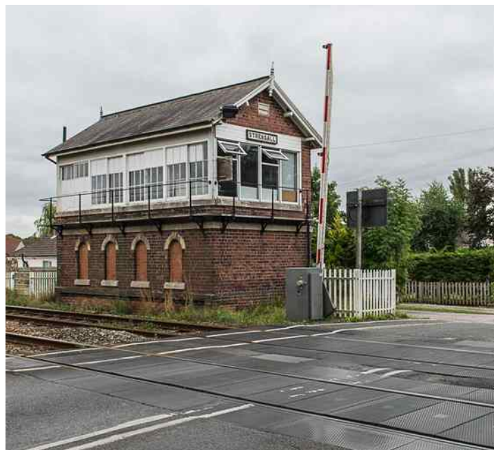
Strensall Signal Box

The east end of Strensall was developed from the mid-1840s as a result of the arrival of the railway in the Village. This was the first expansion of the Village outside its historic core. This Conservation Area was designated in 2001 as a result of action by the Parish Council. It was further expanded in 2011 following public consultation. It includes the former Station Yard and its storage facilities as well as 93-103 The Village, late 19th Century brick-built small terrace houses erected for both the railway workers and those employed at the local brickworks. The old Station House is a listed building, which forms a group with the Signal Box. This Signal Box is the last of its kind on the York-Scarborough railway line.