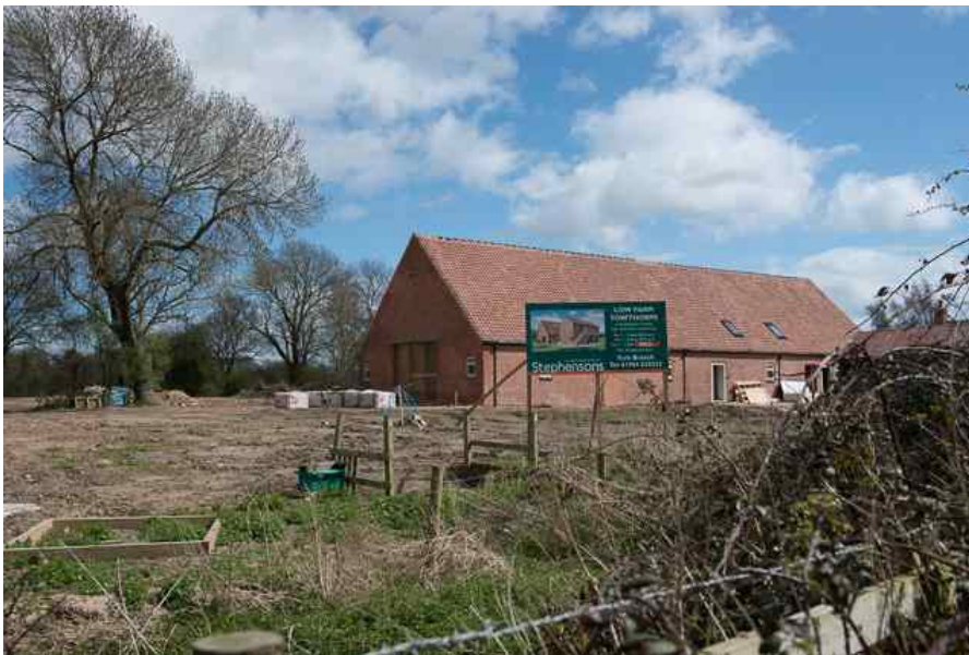
Towthorpe - The conversion of agricultural buildings

Towthorpe is a small hamlet which has survived as a peaceful cluster of 19th Century or earlier brick farmhouses and farm buildings set in the countryside on the southwestern side of Strensall.