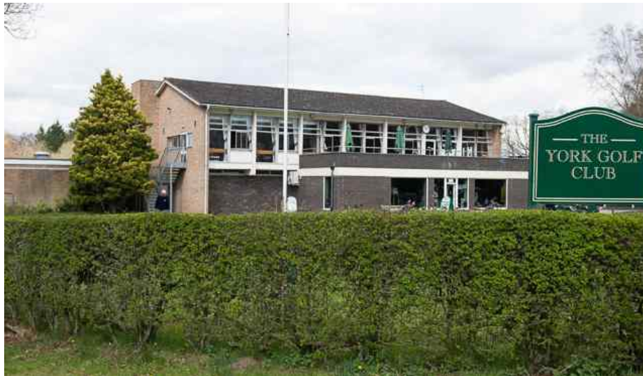
Clubhouse, the York Golf Club

The York Golf Club, the oldest golf club in the area, was established in 1890 as a members' club. The Club is a non-profit making organisation which reinvests all surplus income back into the Club. It is a Community Amateur Sports Club under the terms of the Finance Act 2002 and it provides sporting and related social facilities to the community. It prides itself on its Junior and Lady Golfer starter programmes. The course itself is a serene blend of parkland and heathland with a definite emphasis on natural beauty rather than artificial features. It measures 6290 yards (Men's Competition Tees) and the greens are acclaimed to be among the finest in North Yorkshire. The Club has invested heavily in improving the drainage of the course in recent years.