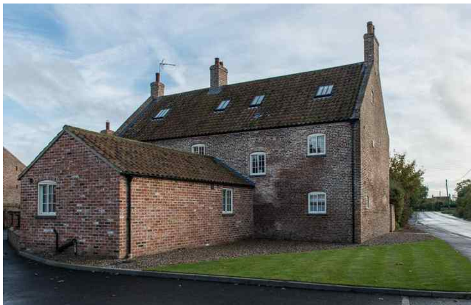
Low Farm Farmhouse Towthorpe

The Towthorpe Conservation Area was designated in 2001. It includes Towthorpe Moat and also Low Farm Farmhouse, a Grade 2 listed building which retains the original internal doors and baluster staircase. Development which has taken place is sympathetic to the existing 19th Century or earlier brick buildings. Much of the Strensall Military Training Area including part of the Barracks is also located in Towthorpe, as is the Barley Rise development.