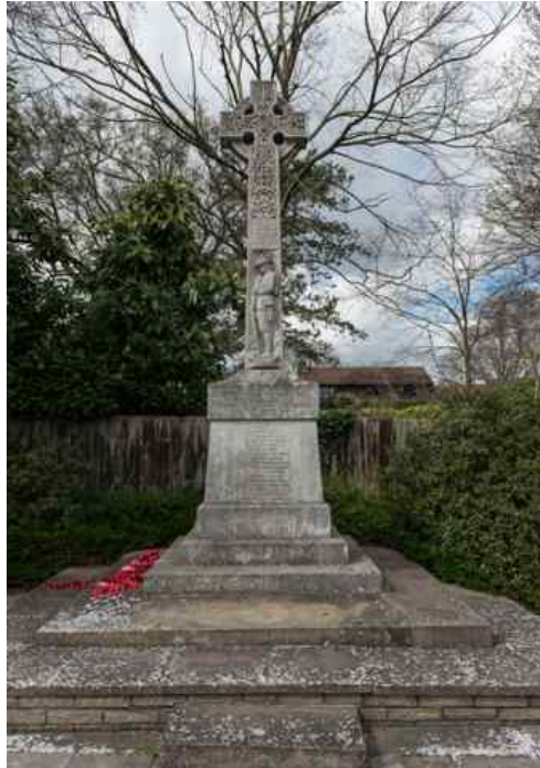
Strensall War Memorial