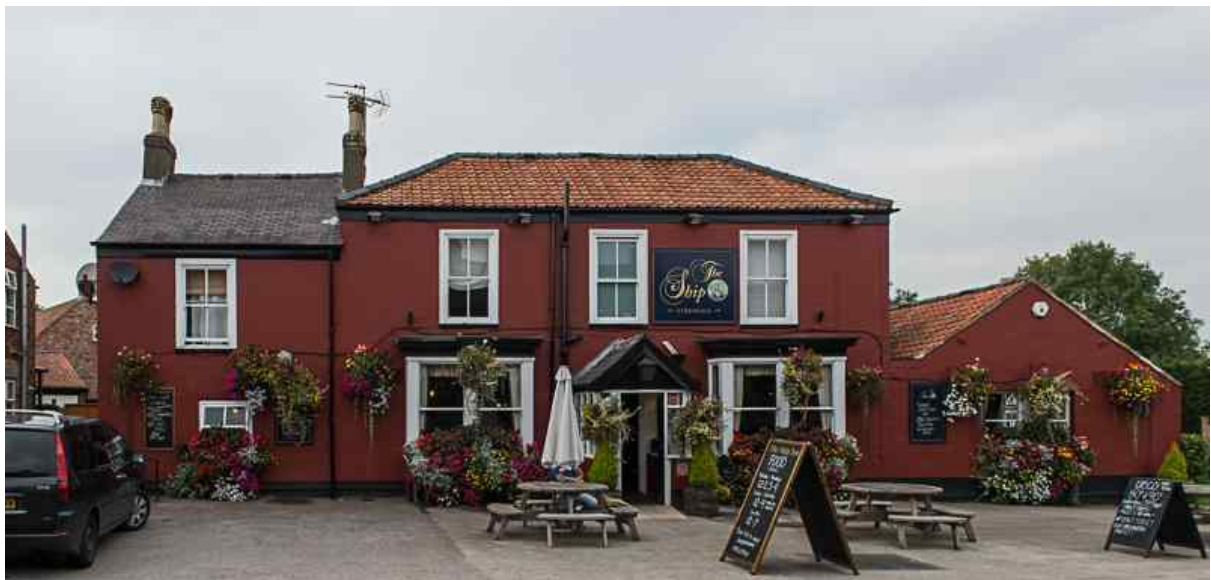
The Ship Public House

Some of the buildings within Strensall have rendered or painted facades, for example The Ship Public House. Although the use of render and painted brickwork is not the predominant material for external walls within the area, these buildings also contribute to the character and appearance of the area.