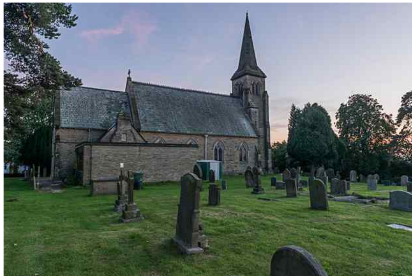
Church of St Mary the Virgin.

There are three places of worship in the Village, the Church of St Mary the Virgin, the Methodist Church and the Garrison Church.