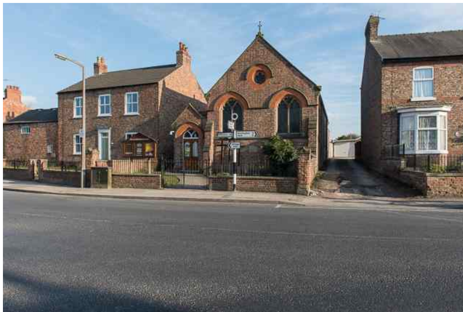
Strensall Methodist Church

The first Methodist Chapel in the Village was St Mary's Hall in Church Lane. It was built in 1879, the porch being added in 1895, but the building was too small for the Methodist community's needs. It then became a dwelling house until 1983 and it has now fallen into disrepair. The new Methodist Church was built on The Village in 1895, on the site of the "Village Pinfold", a holding pen for stray animals. The Church was built on a scale better to serve the expanding Methodist community. The Villagers still use the expression "the Methodist Chapel" for this Church.