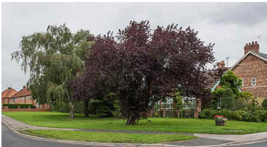
The entrance to Northfields

Most of the more modern buildings in this character area are constructed in a sympathetic brick and are of a simple form.